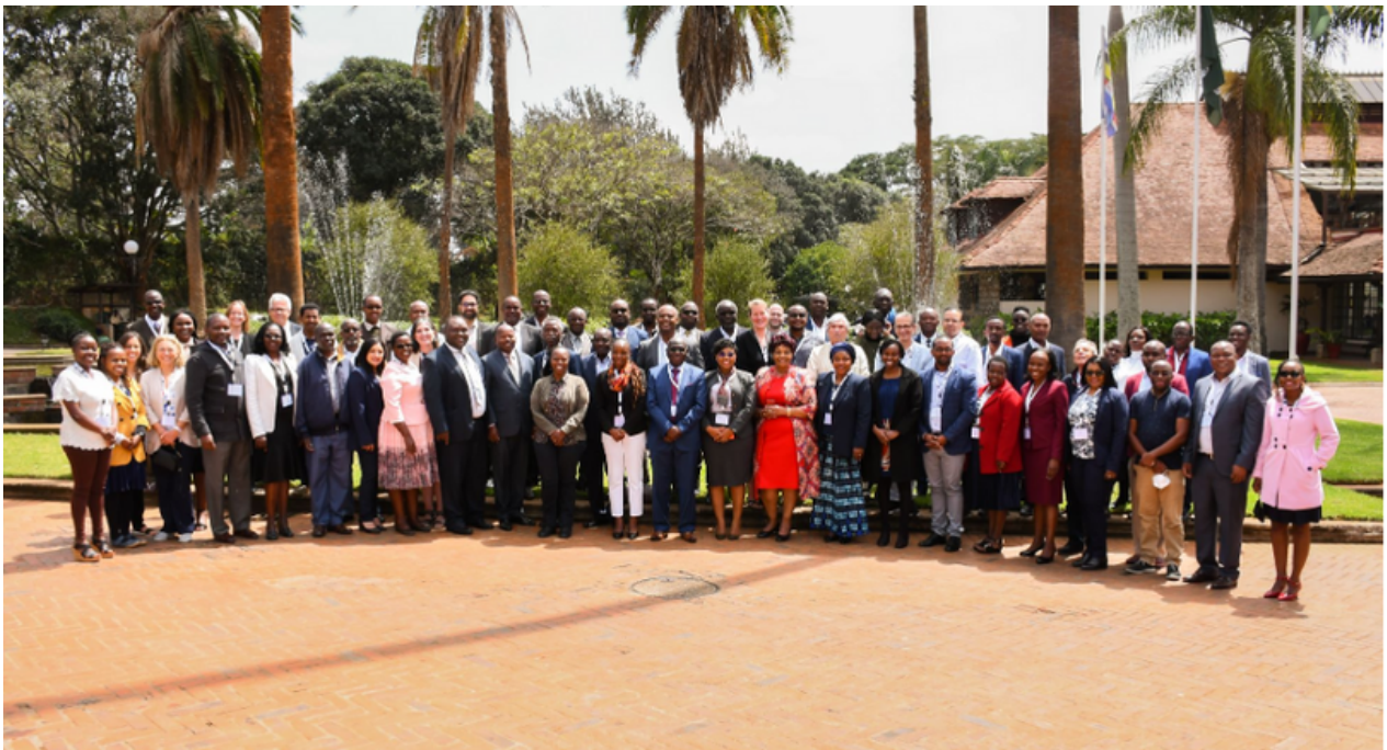
Group Photo of Workshop Participants

For more information, please visit our website and read our Press releases - EU-Africa PerMed (euafrica-permed.eu)