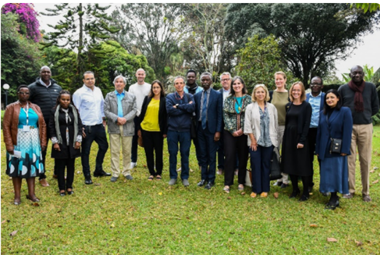
First face to face consortium

On 12th July 2022, the EU-Africa PerMed consortium had its first onsite consortium meeting in Nairobi Kenya, hosted by the Kenya National Commission for Science, Technology and Innovation (NACOSTI). This was 18 months since the project started, which gave members of the consortium an opportunity to finally discuss face to face on the evolution of the project under different work packages and exchange views with Advisory Board who managed to attend the meeting. The 1st regional stakeholder workshop was also conducted, for two days. This workshop was an important milestone for the project, as it provided a first opportunity to discuss with stakeholders from East Africa countries, about Personalised Medicine, main challenges facing the region and opportunities for collaboration with Europe. Otherwise, we continue to host ongoing work package meetings to discuss and ensure that all stakeholders are clearly engaged.