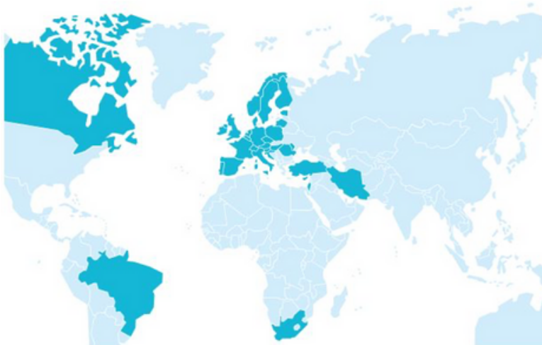
Figure 1: ICPerMed's members map is a derivative of "World Map for Web Data Visualizations" by Al MacDonald, used under CC BY-SA 3.0.