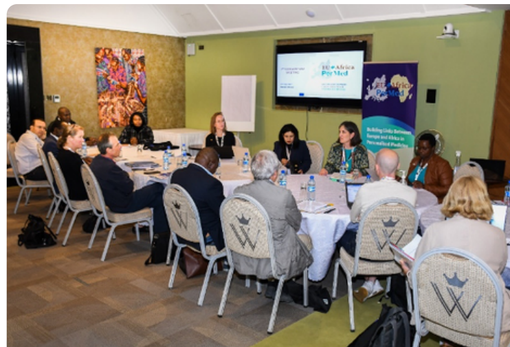
Family photo during the Kenya Meeting